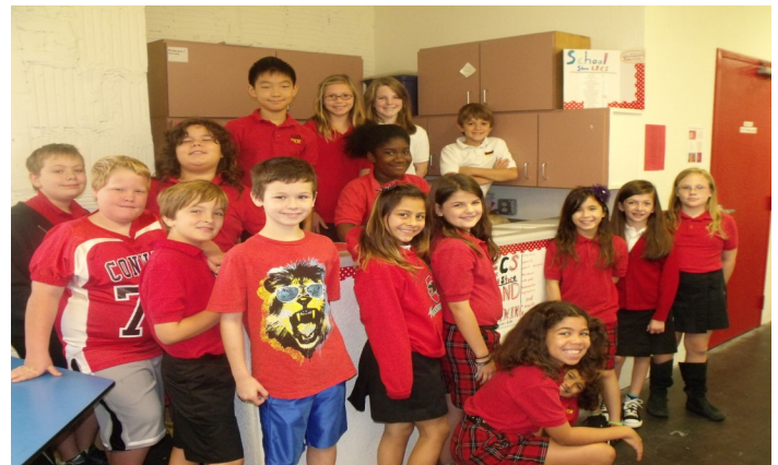
Gifted Student Team Wheel

Cluster II Team Wheel students have had a fantastic start to the new school year. They meet every Wednesday, extending the common curriculum to include critical thinking, service learning and ways to benefit the well-being of LECS. The excitement is definitely present among students as they are motivated and empowered to assume leadership roles in many facets of the school. The School Store is well underway and has been a huge success due to the volunteer hours put in by the cluster two students. The school store is generally open five days a week from 7:45-8:00 am. Students arrive at 7:30 in the morning. The store is fully manned with three students every day for setup, sales and then clean up. This all wraps up just in time to arrive in home-room to start the school day. They are excited about things to come.